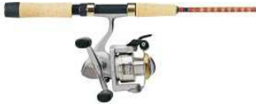
Example of a Spinning Rod & Reel